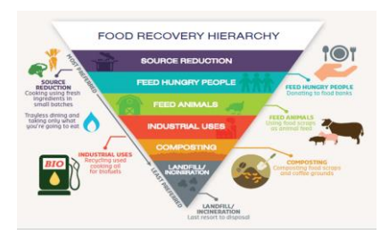
Fig1. Food waste management hierarchy( Stefano Ghinoi, et.al.2020)

While it is ideal to stop the production of food waste at the source, some waste cannot be prevented (such as bones, shells, and husks). If recycling is an option, food waste that cannot be avoided should be. Instead of being burned at waste-to-energy facilities, food waste can be recycled into useful materials or products like animal feed, compost or fertilizer, non-potable water, or biogas for energy production. Homogeneous food waste, including spent grains, okara, bread, and fruit and vegetable waste, has the potential to be transformed into goods with higher value, such as animal feed and cleaning agents. Additionally, separating food waste for treatment has additional advantages, such as lowering pest 0and odor problems on the property and preventing contamination of drinking water (7).