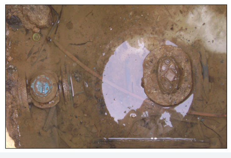
Figure 3: Leaks in water supply network.