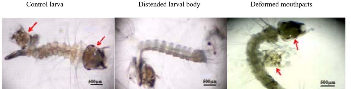
Larvae with two heads, a normal one and another one attached to the abdomen or in place of the saddle